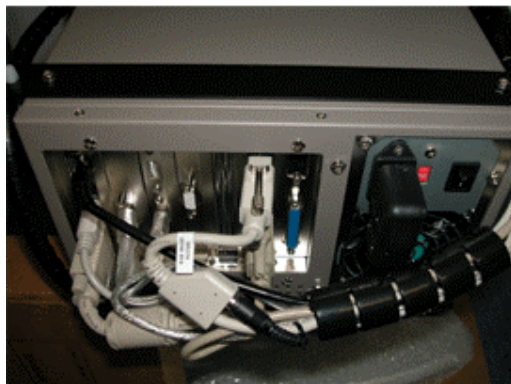
Figure 3: Equipment connections below the PC.