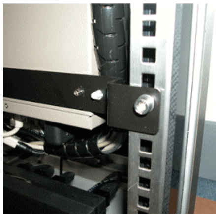
Figure 2: Lower PC bracket attached to the kiosk frame.