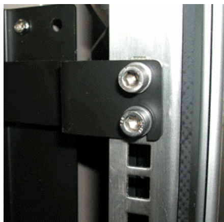
Figure 5: Upper PC bracket.