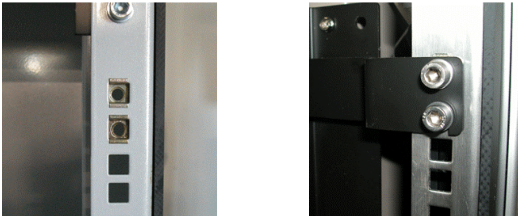
Figure 2: Kiosk frame with nuts (left picture) for the upper PC bracket (installed, right picture).