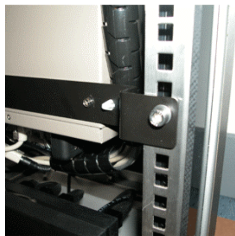
Figure 5: Kiosk frame with nut (left picture) for the lower PC bracket (installed, right picture).

This concludes the installation of the PC case in the Identity Kiosk.